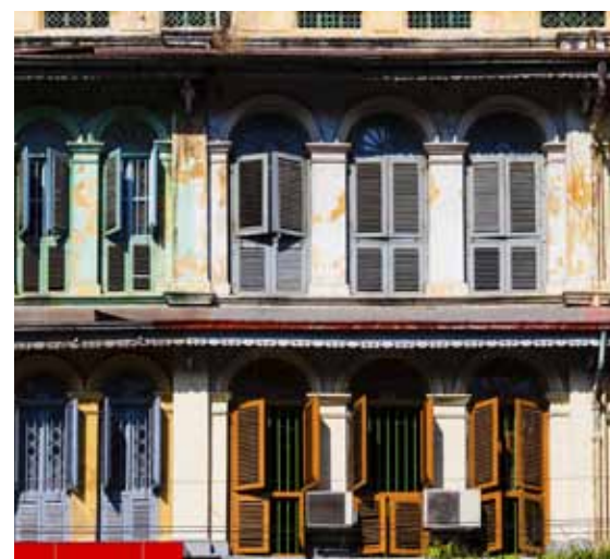
Walking Tour of Old Yangon - HD Myanmar - Yangon

Stroll along railroad tracks that snake through Hanoi's Old Quarter – in some areas only a few short steps from the front doors of residents. Enjoy an up-close look at the lives of locals and how they adapt when the train passes by twice daily. The journey continues through the neighborhood's shops and to the nearby urban island to see its orchards and relax.