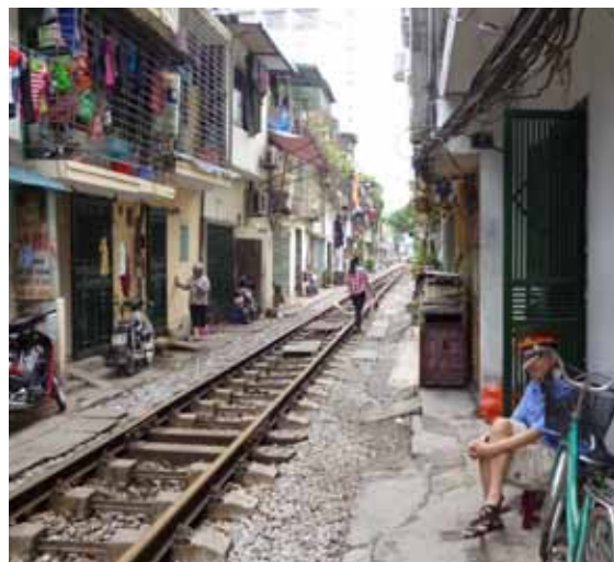
Walk the Rail Tracks of Hanoi - HD Vietnam - Hanoi

Walking and cycling tours are the best way to get up close and personal with local people, their cultures, and their natural surroundings. From the picturesque emerald rice paddies of Ubud, and the awe-inspiring temples of Angkor Wat, to the hidden alleyways of its bustling cities, Asia offers a diverse array of settings for unforgettable experiences.